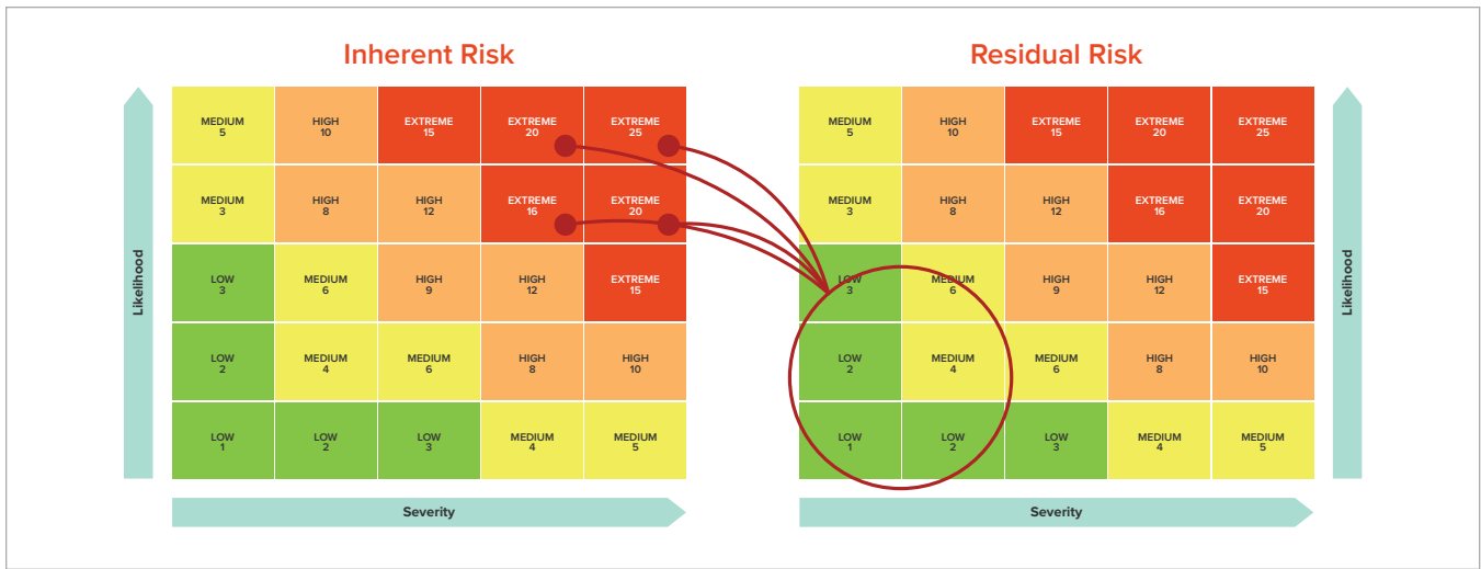
Figure 2. Example change in risk with Quest